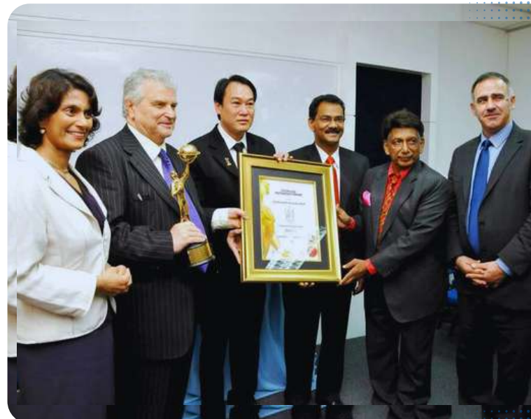
Receiving an Award for Best Clinical Hypnotherapy College in Asia

Embracing kindness in another's trouble is at the heart of our ethos.